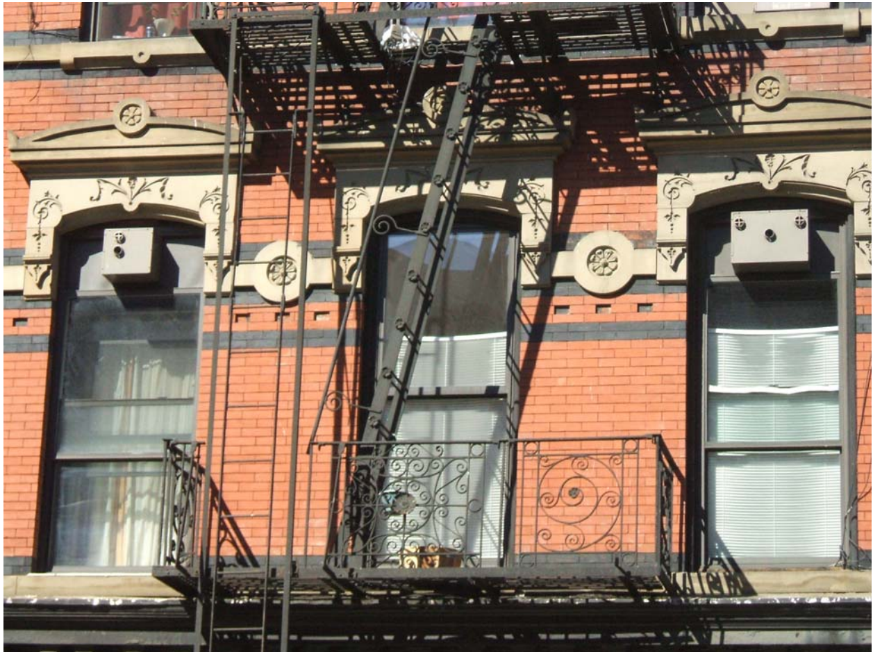
Figure 2. Lintel and fire escape details of 101 Avenue A.